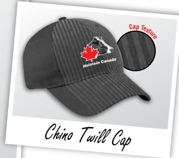
Chino Twill Cap