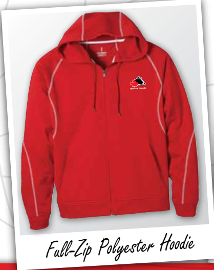
Full-Zip Polyester Hoodie

Holstein Canada Check out our NEW official World Holstein Conference apparel plus much more!