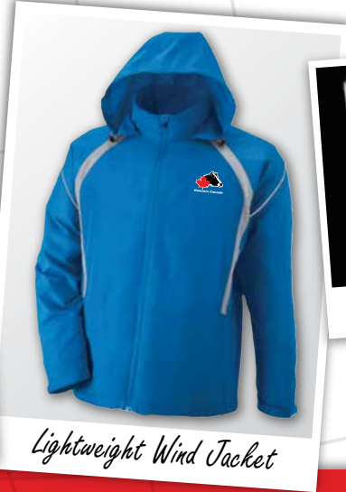
Lightweight Wind Jacket