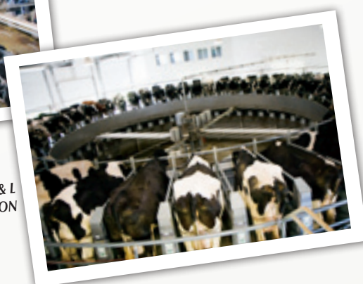
Terry Fox Tour: J & L Walker Dairy, Aylmer, ON