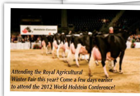
Attending the Royal Agricultural Winter Fair this year? Come a few days earlier to attend the 2012 World Holstein Conference!

Always a staple in the fall of the year, both the Québec International Holstein Show and Royal Agricultural Winter Fair (RAWF) display the greatest animals from North America! While you may have already planned to attend the RAWF, why not come a few days early and enjoy the 2012 World Holstein Conference before staying to watch what is considered one of the best dairy shows in the world! The spectacle of the well-organized Québec International Holstein shows will also be a stop not-to-miss while you are on the pre-tour in Montreal, Québec.