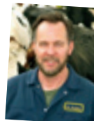
Ken Nordlund USA

Approximately 75% of dairy cow disease events occur in the month during the transition period of 3 weeks before through the month after calving. Because these events happen early during the lactation, Ken Nordlund will discuss how these diseases have a huge impact on future survival and milk yield. He will also discuss the significance of having a management system to evaluate and monitor this transition period relating to improving dairy herd productivity. A method called Transition Cow Index™ (TCI™) has been developed and Nordlund will present the findings of studies that show TCI™ to be negatively associated with fresh cow disease events.