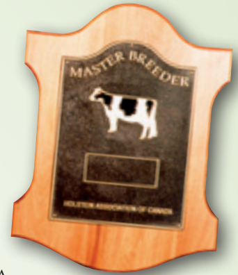
Figure 1: Newly-approved credentials to achieve points for production, classification, and longevity

This year's preliminary Master Breeder results will be mailed to the top 15% potential recipients in October 2012 according to these new standards. Rankings of 11 th or below in each of eight herd groups will be indicated. Breeders in the top 10 will be notified, but not told their specific ranking. Official results will be calculated the first week of January 2013. Recipients will be honoured at a gala banquet during the Holstein National Convention in Niagara Falls, Ontario in April 2013. 🇨🇦