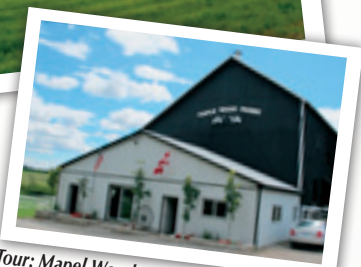
Wayne Gretzky Tour: Maple Wood Holsteins, Jerseyville, ON