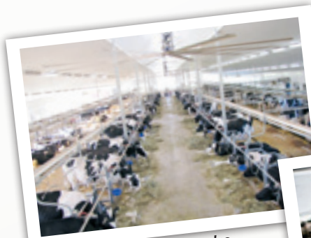
David Suzuki Tour: Bosdale Farms Inc., Cambridge, ON